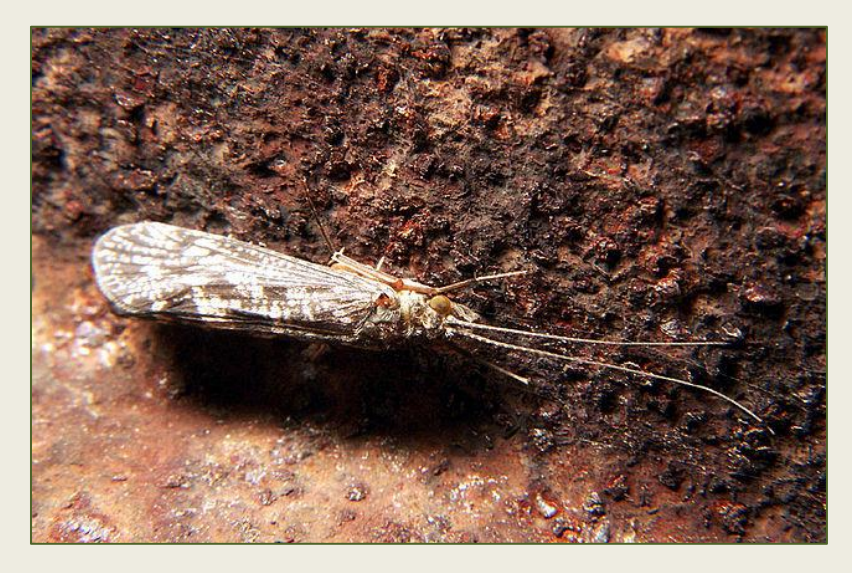
Caddisfly