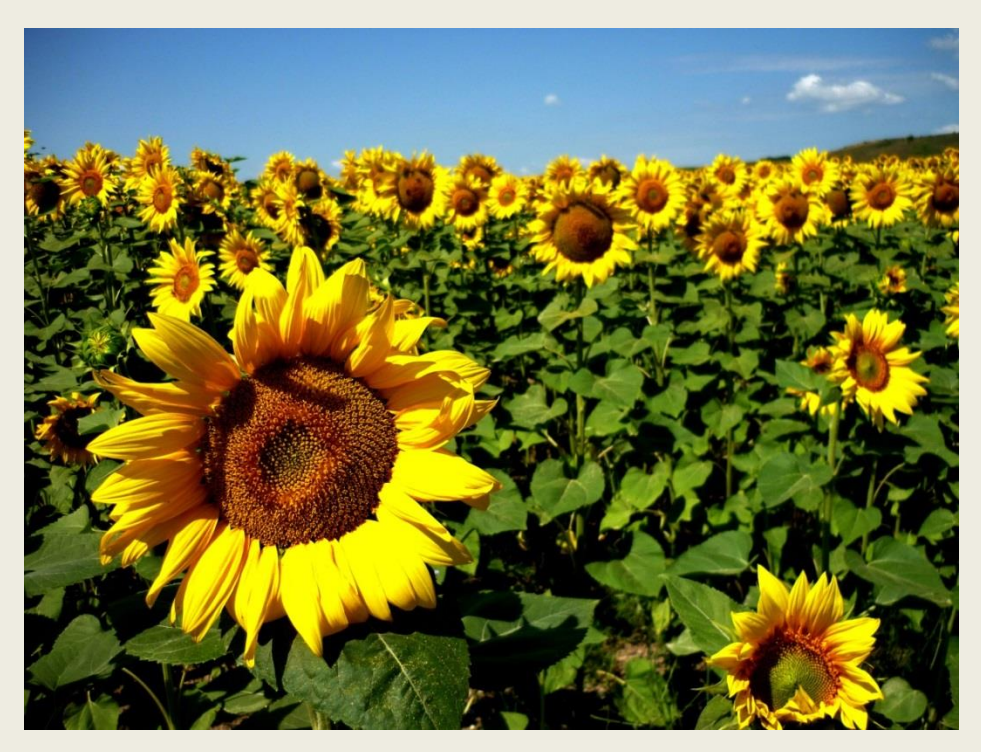
Sunflower field