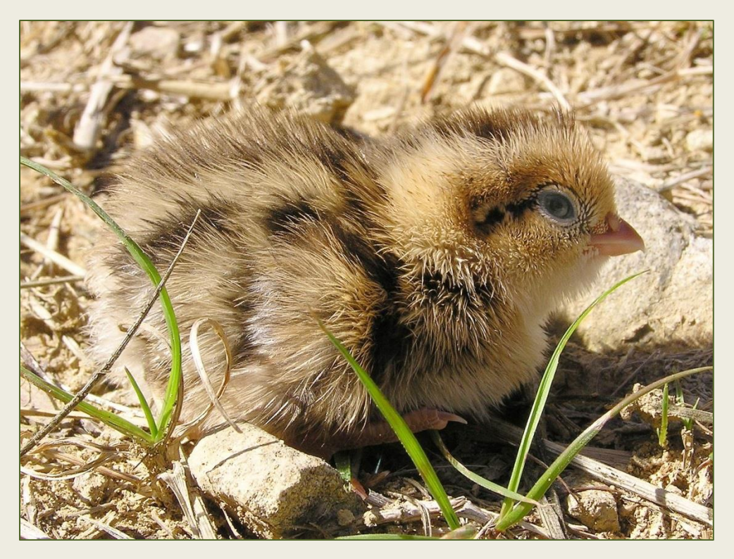
California Quail chick