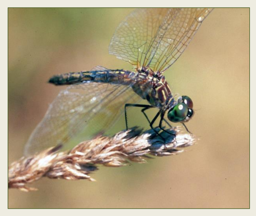
Dragonfly on wheat

A species sensitivity distribution based on the normally distributed acute data returns an HC5 of 1.01 ug/l for crustacea (0.06-6.8) and an almost identical 1.02 ug/l for aquatic insects (0.31-2.06). Despite the overlap, the insects appear to have a much lower sensitivity variance – i.e. more similarity in response. A pulse of imidacloprid in the ug/l range would therefore be expected to affect a larger proportion of the insect community.