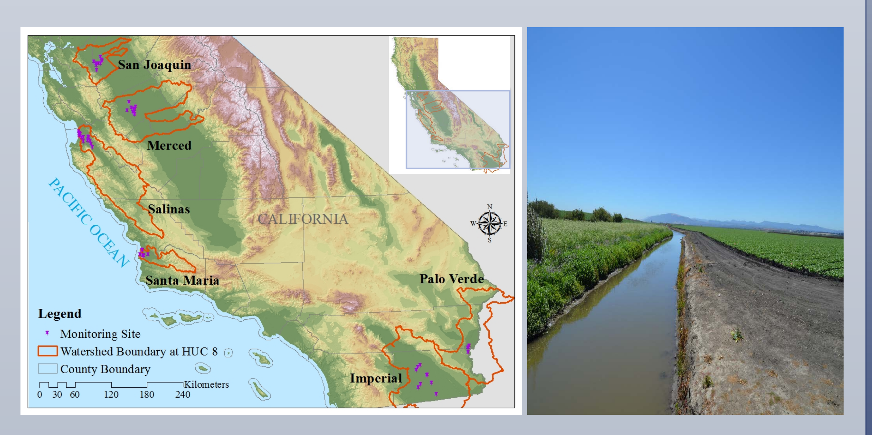
Figure 1. Agricultural areas of monitoring sites in California

Over 750 pesticide active ingredients (Als) in a total amount of 175.3 million pounds were applied in agricultural areas of the state in 2011 (CDPR 2013). Those pesticide Als possess a wide range of toxicity to aquatic organisms (US EPA 2014). In order to conduct the statewide monitoring effectively and better use limited resources, CDPR recently developed a pesticide Monitoring Prioritization Model (MPM) that automates the process of identifying potential monitoring candidates (Luo et al. 2013). The model develops a ranking of Als based on their use amounts that were reported to the CDPR's PUR database and their toxicity "Aquatic Life Benchmarks" that were developed by US EPA (US EPA 2014). Pesticide Als that were selected as monitoring candidates for 2013 were identified using the MPM based on the statewide PUR data from 2009-2011. Additional region-specific assessments were conducted to identify Als that have significant aquatic toxicity and high use within a specific geographic region, but for which use was not high enough on a statewide basis to rank in the statewide analysis.